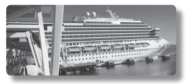
The Splendor Cruiseliner