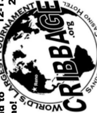
Bill Shoemaker Tournament of Champions