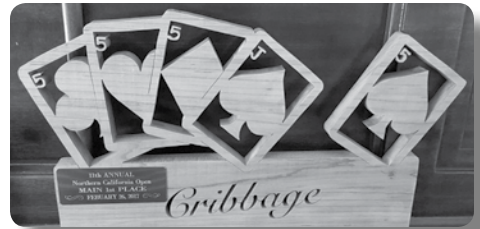
First-place NCO trophy

sought to attract cribbage players by offering free playing space, underwriting much of the food and beverage service including lunch, and gifting $5 of free play each day of the tournament. The resort offers well-appointed rooms at a discounted rate of $89 plus tax/night to tournament attendees.